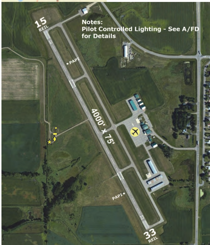
Hutchinson Municipal Airport - Butler Field

SEC. CH: TWIN CITIES LAT: 44-51-35.600N LONG: 094-22-57.000W Approaches: VOR RNAV COMM: 122.8 (L) WX: VHF 118.525 CTR: 127.1 MSP GCO: 121.725 CLNC DEL: 651-463-5588